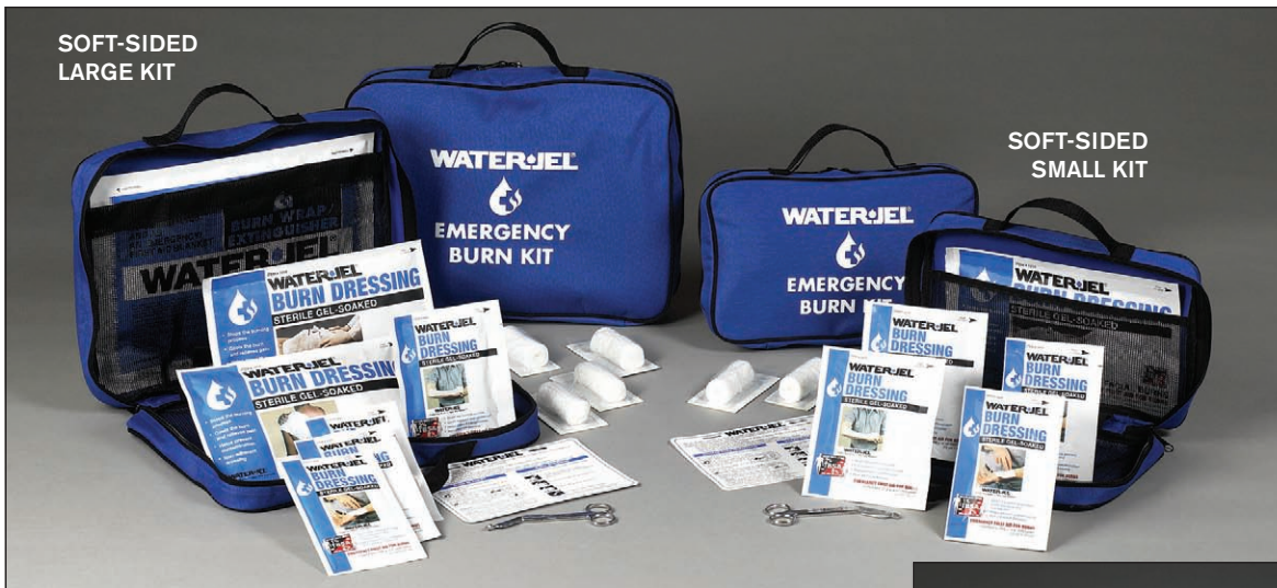
SOFT-SIDED LARGE KIT