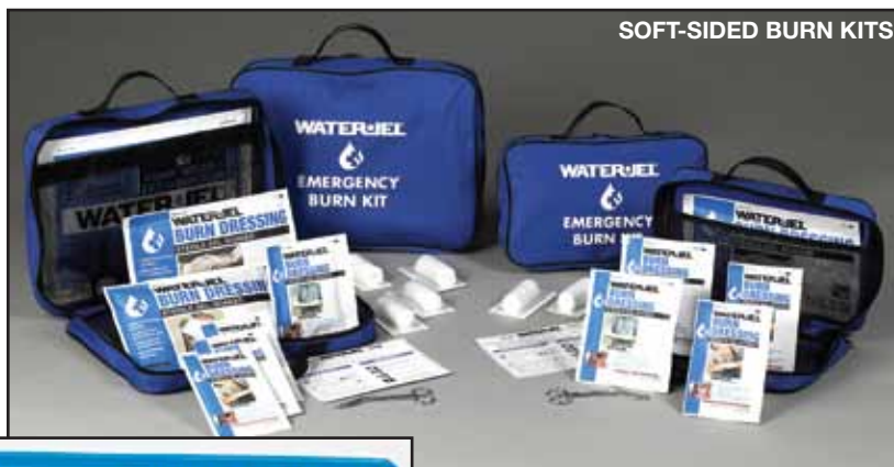
SOFT-SIDED BURN KITS

The Leader in First Aid Emergency Treatment for burns.