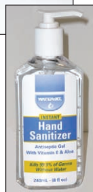
8 oz Pump Bottle