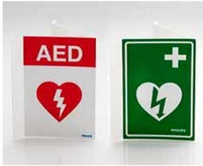
AED Wall Sign

An AED Wall Sign hanging above a Wall Mount Bracket or Defibrillator Cabinet gives even greater visibility to the defibrillator. Can be mounted three different ways to maximize visibility: T-mount, V-mount or Corner Mount. Face dimensions: 9" (23 cm) h, 6.1" (15 cm) d