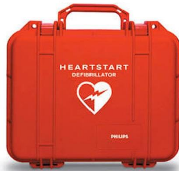
FRx Hard-Shell Carrying Case

Constructed with easy-to-clean urethane, this case is durable enough to withstand bumps and drops, and provides easy access with a VELCRO® closure. The FRx case holds and protects your FRx Defibrillator and optional accessories, including a spare battery, two pads sets, the Infant/Child Key and Quick Reference Guide (989803138601). Includes strap. Dimensions: 9.5" (24.1 cm) w, 8.0" (20.3 cm) h, 5.0" (12.7 cm) d