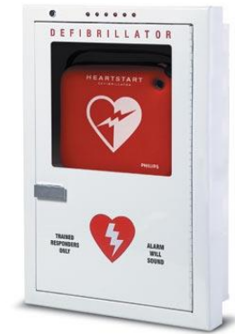
Premium Semi-recessed Cabinet

Dimensions: 16" (41 cm) w, 22.5" (57 cm) h, 6" (15 cm) d