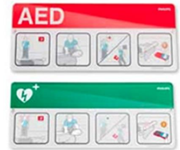
AED Awareness Placard

The Wall Mount Bracket is designed specifically for housing a Philips HeartStart defibrillator and its accessories. The defibrillator's carry case can be tethered to the Wall Mount Bracket with a breakaway Secure-Pull Seal (M3859A) to discourage tampering. A broken seal indicates that the defibrillator has been removed from the Wall Mount and accessories may need to be replenished. The Fast Response Kit (68-pchat) tucks neatly behind the Defibrillator Case. Dimensions: 10.5" (27 cm) w, 8" (20 cm) h, 6.9" (17 cm) d Weight: 18.4 ounces (0.52 kg)