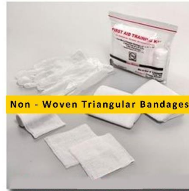
First Aid Training Kit

Cost effective solution for First Aid Training: