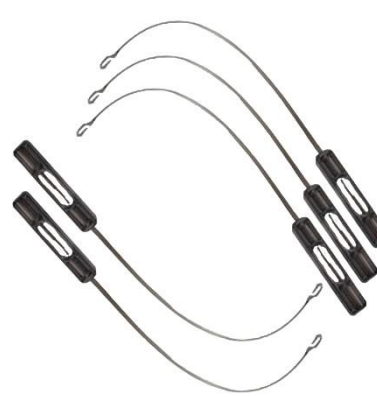
Face Shield/Lung Bag Insert Tool 5 Pk CPR Prompt