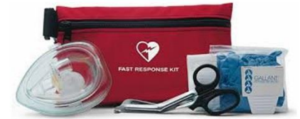
Fast Response Kit

The unique Infant/Child Key is used only with the FRx Defibrillator when treating an infant or child who is under 55 lbs or 8 years old. Once the Infant/Child Key is inserted, the FRx automatically reduces the defibrillation energy and provides voice and visual instructions and CPR coaching specifically geared for treatment of infants/ children. Graphics on the key show proper pad placement for infants and children.