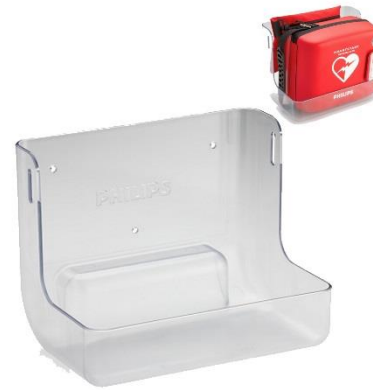
FRx Wall Mount Bracket

Our waterproof carry case made of hardshell plastic is suited for more rigorous use, particularly in wet outdoor settings. It can also accommodate a spare battery, spare pads cartridge, and the contents of the Fast Response Kit. Dimensions: 13.5" (34 cm) w, 12" (30 cm) h, 6" (15 cm) d