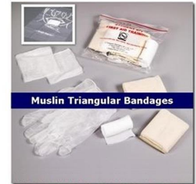
Student First Aid & CPR Training Kit w/ Muslin Bandages

Cost effective solution for CPR and First Aid Training: