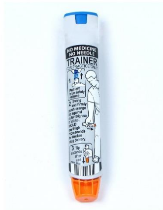
EpiPen Trainer - Auto-Injector Training Device

The perfect training tool for teaching proper technique and protocol for EpiPen use. Contains no fluids, epinephrine or needle. A medical letter is not required to make this purchase. For Training purposes only. (10 pc min)