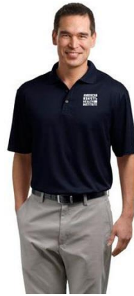
ASHI Instructor Mens Polo Shirt

ASHI Men's Fine Jaquard Polo - Navy, Lightweight and breathable, this shirt features a subtle jacquard texture. But the best part comes from what you can't see. Designed with moisture-wicking performance, this shirt won't run flat. 3.8-ounce, 100% polyester, Double-needle stitching throughout, Flat knit collar, 3-button placket with pearlized smoke buttons and open hem sleeves. (S,M,L,XL,XXL,XXXL)