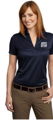
ASHI Instructor Womens Polo Shirt

ASHI Women's Fine Jaquard Polo - Navy, Lightweight and breathable, this moisture-wicking shirt has a pleasing drape, subtle jacquard texture and an open placket for feminine style. 3.8-ounce, 100% polyester, Double-needle stitching throughout, Gently contoured silhouette, Self-fabric collar and Open hem sleeves