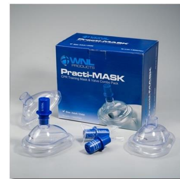
Practi-MASK Adult/Child CPR Training Mask and Valve (10/Box)

The Practi-MASK Adult/Child CPR training mask & Practi-VALVE combo is a cost effective tool for classroom training of CPR, and provides an alternative to the use of traditional CPR resuscitator with human use one-way valve. The Adult/Child Practi-MASK includes a soft, pliable bladder for conforming to manikin faces. The Practi-VALVE features a cotton breathing filter.