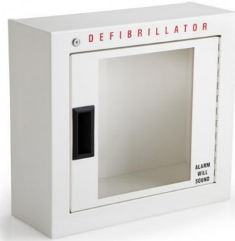
Basic Wall Mount Cabinet

An AED Wall Sign hanging above a Wall Mount Bracket or Defibrillator Cabinet gives even greater visibility to the defibrillator. Can be mounted three different ways to maximize visibility: T-mount, V-mount or Corner Mount. Face dimensions: 9" (23 cm) h, 6.1" (15 cm) d