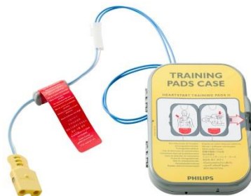
Training Pads II

This training version of HeartStart FRx Defibrillator includes Trainer, Training Pads II, Carry Case, Instructions for Use, Quick Reference, and an external manikin adapter. This product can be used on a manikin equipped with an internal manikin adapter(M5088A) or an external manikin adapter (M5089A).