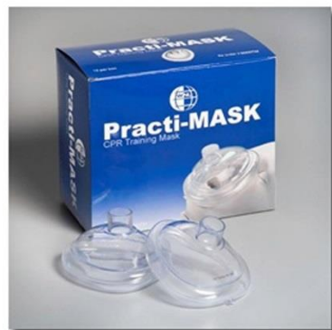
CPR Practi-Mask (10/Box)

Training masks provide a cost effective solution for teaching CPR without using a more expensive rescue mask. Soft, pliable bladders conform well to manikin faces. This is a box of 10 masks only – valves are sold separately.