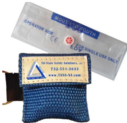
CPR Faceshield with One-Way Valve in Nylon Keychain/Pouch

CPR face shield in nylon CPR keychain pouch. Perform CPR and artificial resuscitation without the risk of ingesting harmful bacteria. Rescue Breather features a true one-way valve and mouth-to-mouth barrier. Secures over ears for hands free operation. One size fits children to adults. (Quantity pricing discounts)