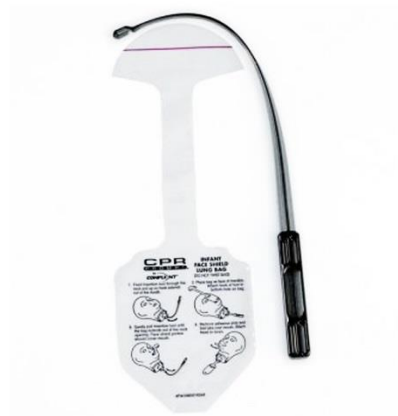
Adult / Child Face Shield Lung Bags CPR Prompt (Pkg 100)

Single use Adult/Child Face- Shield/Lung Bas has a unique adhesive strip to ensure face shield stays in place during training.