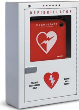
Premium Surface Mount Cabinet

Dimensions: 16.5" (42 cm) w, 15" (38 cm) h, 6" (15 cm) d