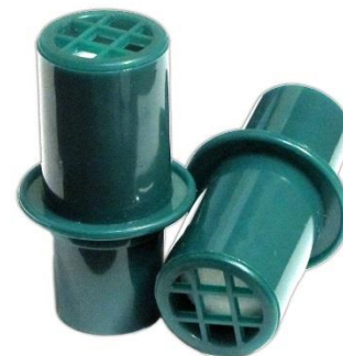
CPR Micromask Trainer Valve - Practi- Valve (10 Pack)

An innovative solution to better use your training dollars! These CPR practice training valves or “Practi-Valves” are the perfect solution for costly training. They’re affordable, one-time use, and fit nearly all CPR masks! This is a must have for any CPR trainer!