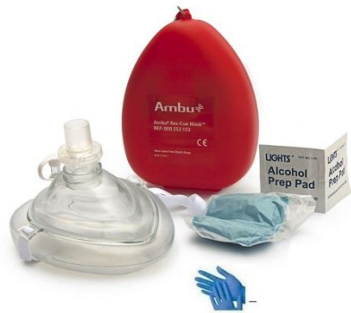
CPR Rescue Masks

CPR Rescue Masks (adult/child rescue mask in a hard shell pouch, includes gloves, alcohol pad, mask and one-way valve. (10pc min – quantity pricing discounts)