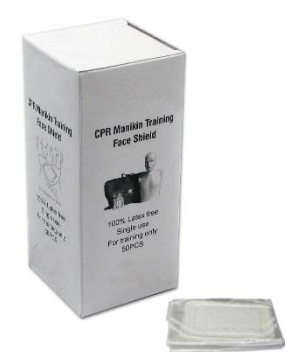
CPR Practice-Shield Manikin Face Shields (50 per box)

CPR Practice-Shields are ideal for CPR and AED training, offering cost effective barrier protection for students sharing a manikin. Individually folded and packed in a dispenser box. Latex free. For training only. Used in addition to disinfection it offers an inexpensive extra barrier protection for students sharing a CPR manikin!