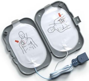
SMART Pads II

Save valuable time in an emergency with pads that can be used on adults, children and infants. SMART Pads II eliminate the expense of having to purchase different pads sets for different patient types. These pre-connected pads are packaged in a semi-rigid pads case for added protection, and are equipped with a HeartStart compatible plug for easy hand-off to Philips ALS defibrillators and to competitive defibrillators with adapters. For patients less than 8 years old or 55 lbs (25 kg), use the infant/child key, if available