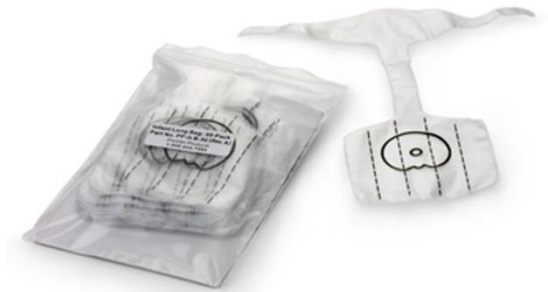
Prestan Infant Face Shield Lung-Bags (50-Pack)