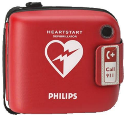
FRx Carrying Case

Constructed with easy-to-clean urethane, this case is durable enough to withstand bumps and drops, and provides easy access with a VELCRO® closure. The FRx case holds and protects your FRx Defibrillator and optional accessories, including a spare battery, two pads sets, the Infant/Child Key and Quick Reference Guide (989803138601). Includes strap. Dimensions: 9.5" (24.1 cm) w, 8.0" (20.3 cm) h, 5.0" (12.7 cm) d