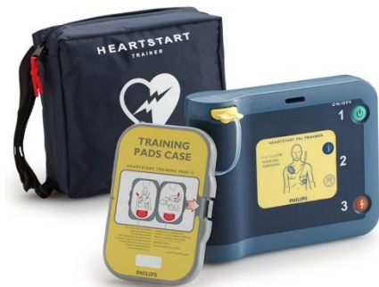
FRx HeartStart Trainer

This training version of HeartStart FRx Defibrillator includes Trainer, Training Pads II, Carry Case, Instructions for Use, Quick Reference, and an external manikin adapter. This product can be used on a manikin equipped with an internal manikin adapter(M5088A) or an external manikin adapter (M5089A).